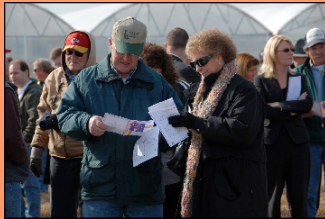
The California & Jefferson City Area Chambers of Commerce hosted a reception in honor of the groundbreaking ceremony for the Hwy 50 project. About 150 people came to celebrate the $30 million expansion of Hwy 50 from St. Martins to California, Missouri.

The Mid-Missouri Regional Planning Commission has provided planning services for the Missouri Department of Transportation since 2000. Planning activities include facilitating transportation advisory committee meetings, enhancement grant assistance for local communities, GIS mapping services, regional transportation plan development, assisting communities with local transportation planning issues, and transportation project evaluation and prioritization activities.