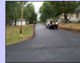
Before and after street improvements in Otterville, Missouri

MMRPC staff has successful experience with the following grants and programs: